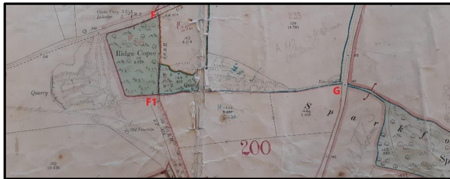
Map sheet 74-7 covering the application route with red letters F, F1 and G added to mark the route.

Reference: SHC DD/IR/OS/74/7 and SHC DD/IR/B/27/1